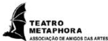
Teatro Metaphora. Portugal